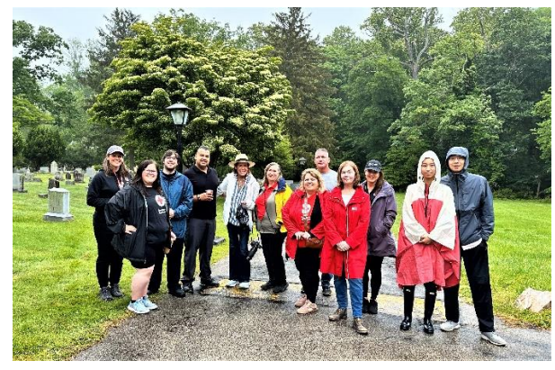
Red Cross Volunteers replacing flags in the cemetery for Armed Services Day