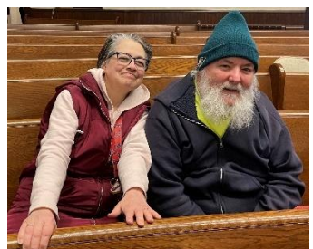
January-August 2023 Messenger pg. 6